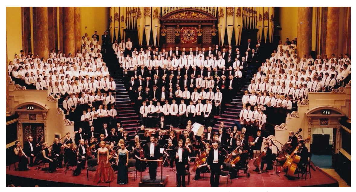
Wetherby Choral Society and Ashville College perform Verdi's Requiem in Leeds Town Hall in 2012

With North Yorkshire Chorus we have given two concerts in Ripon Cathedral, of Elgar Dream of Gerontius and Verdi Requiem , and we shall be joining with Ripon Choral Society in June 2025 for a performance of Mendelssohn Elijah .