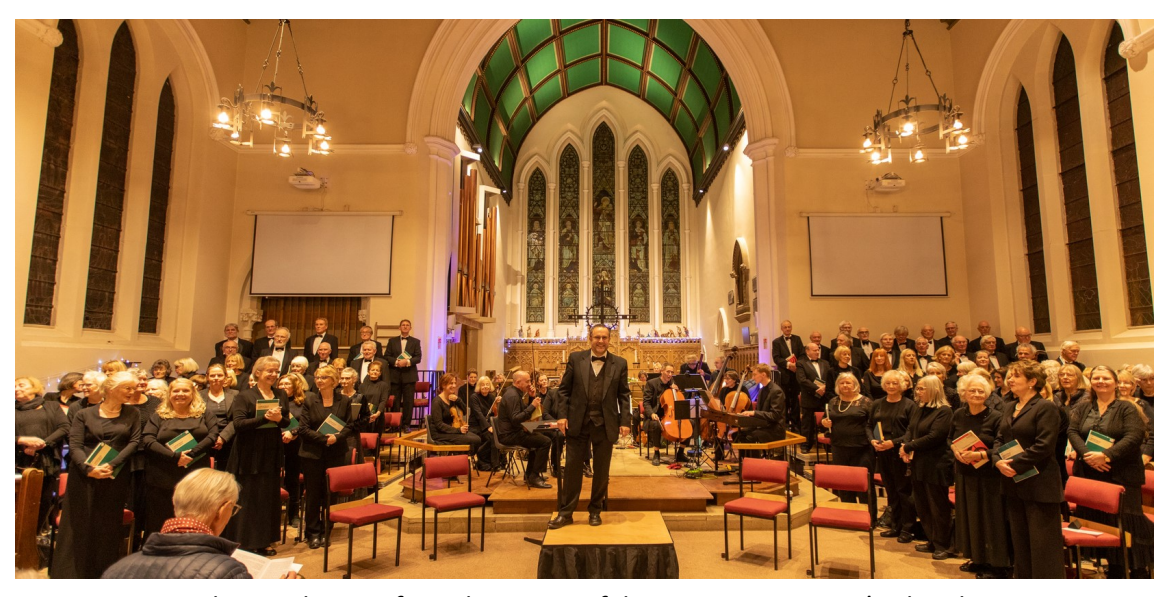
The conclusion of another successful concert at St James's Church