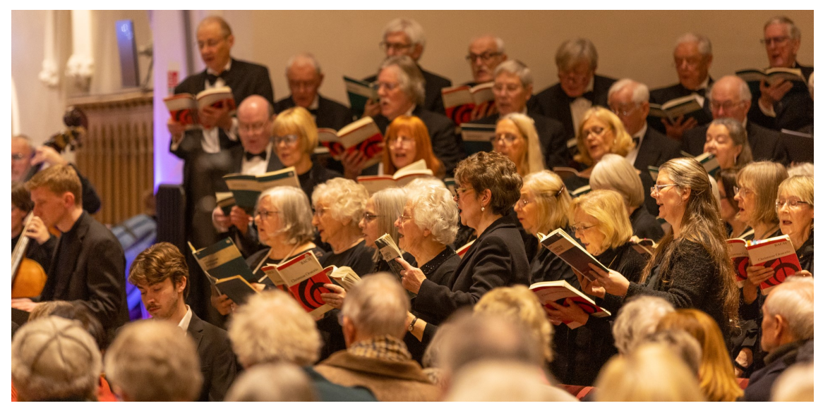
Singers and musicians giving their all in concert

For most of its life the Society had maintained between 75 and 100 members, and during the past 30 years it has had between 90 and 120 singers. Not bad for a small town! As I settled into the post and learnt my trade as a conductor, the range of music expanded still further, repertoire became more diverse and some ambitious projects were undertaken.